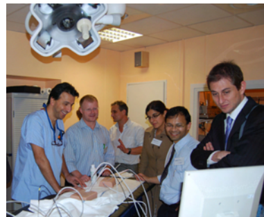
Image-guided cryoablation training in Strasbourg, France.