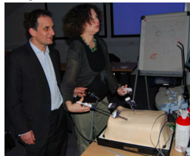
Laparoscopic training in Bristol, England.