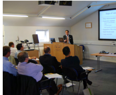
A review of cryobiology in Bristol, England.

Workshop agendas are subject to change. Please contact us at +44(0)1293459848 for latest programme details.